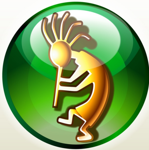
Playing music, listening to music ...