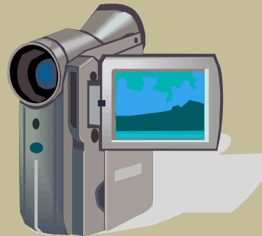
Drama, movie clips ...