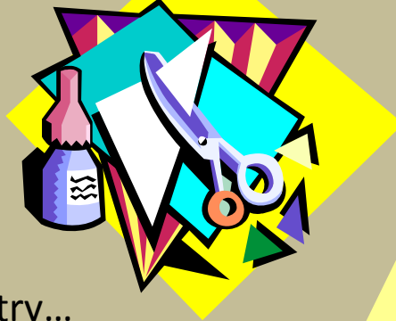
Crafts, creating, ...