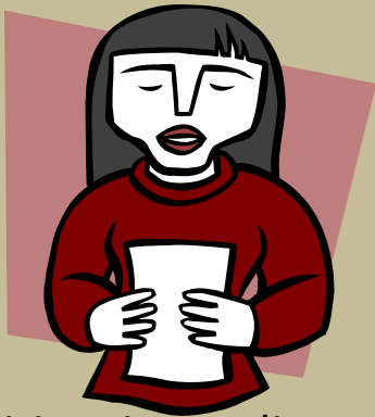
Writing, journaling, poetry...