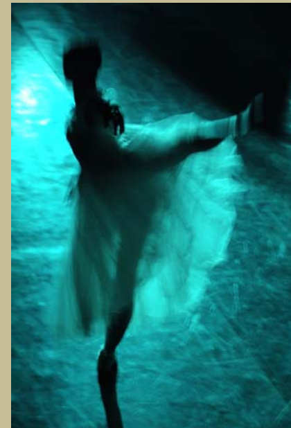
Dance, movement ...